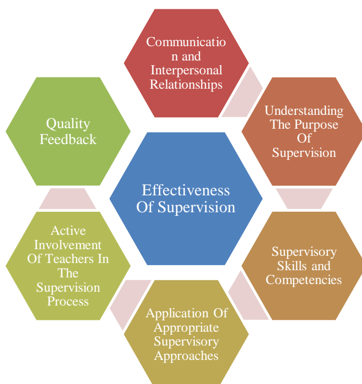
Figure 1. Factors affecting the effectiveness of supervision in education

Surveys show that increased supervision effectiveness strongly supports the sustainable professional development of teachers, and overall contributes to the improvement of the quality of education in the school environment[8]; [45]. By considering in depth, it is important for schools to pay attention to the factors that affect the effectiveness of supervision. This includes the quality of communication between supervisors and teachers that must be open and mutually understandable, as well as a shared understanding of the purpose of supervision to direct teaching development efforts. The supervisor's competence and skills in providing meaningful feedback are also essential to ensuring effective professional development for teachers[46].