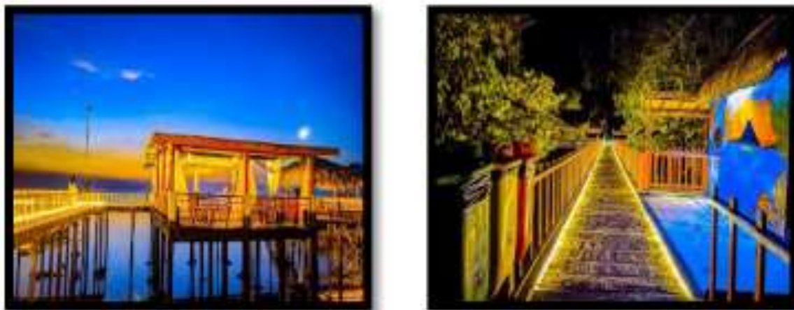
Figure 1. Budo Village

Because initially the people here came from Darunu Village, in 1950, the number of residents in the village began to increase and they began to live independently. In 1965, a man named Yohanis Pinamangung, assisted by several friends, fought to separate this village from Darunu Village. Their goal is to stand alone and form one village consisting of two hamlets or hamlets called the Budo Village village.