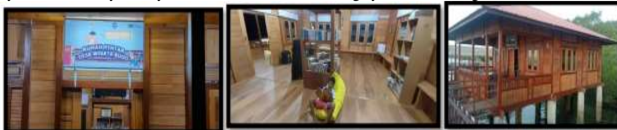
Figure 3. Smart Home Management

Many activities are carried out there through visits from village residents or other visitors so that the general public can use the facilities for free. The management of the Smart House is directly handled by the Village Government and BUMDES. So the monitoring process in the use of facilities by the community is very clear, because the monitoring system is running.