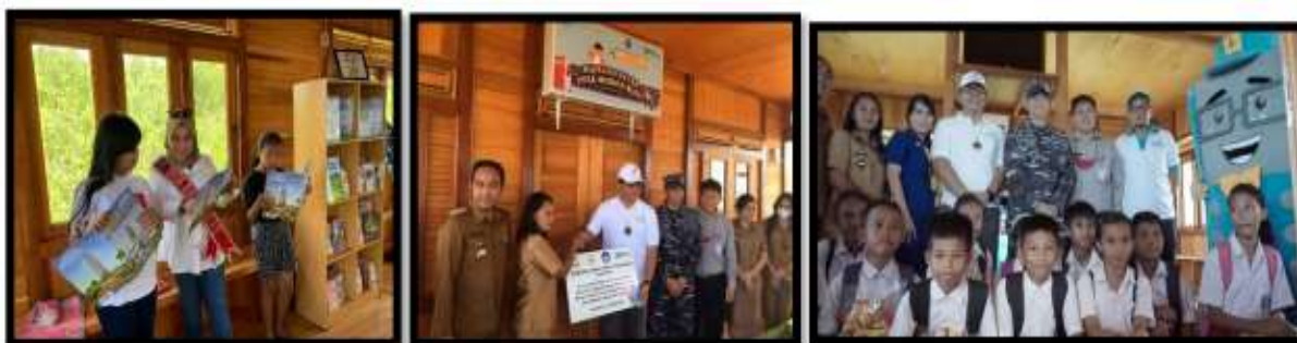
Figure 2. Community Improvement Development (CID) Program