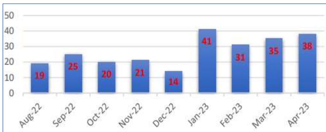
Figure 6. Number of Community Visitors