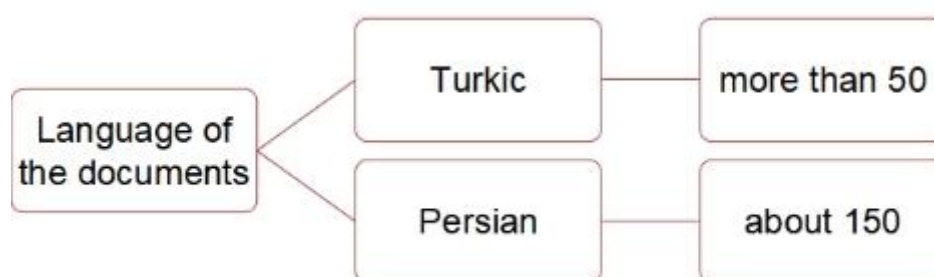
Figure 3 Categorization of Historical Documents by Language

The documents are written in Turkic and Persian. During the Shibanid period, particularly in the Tashkent estate founded by Suyunch-Khwaja-Khan, the Turkic language was given more importance than in other Shibanid regions. Consequently, many decrees from this period are in Turkic. The Akhsikent province, ruled by Suyunch-Khwaja-Khan's descendants, was part of the Tashkent estate. During the Ashtarkhanid and Ming periods, decrees were often written in Persian. Examples include decrees from the reigns of Imam-Quli-Khan, El-Muhammad Sultan, Narbutabi (1770-1798), and Muhammad Rahim (NAUz) (See Figure 3).