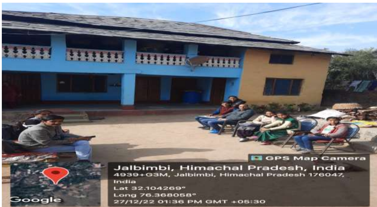
Plate: 1 Semi-Pucca House

The size of dwelling comprises maximum of double storey. Some of the household are three storeys' where the ground floor mostly used for animal shelter and middle for residential area and top for storing dry grass in winter season. The design of dwelling of Tharu Village includes veranda in their houses. Aangan (open space in front of house) can be seen each and every household of this village. Aangan is the place attached in the front of the houses, many rituals are performed in this place, most of the household activities are done in this place, and it is made up of mud, cow dung slurry and kucha in nature.