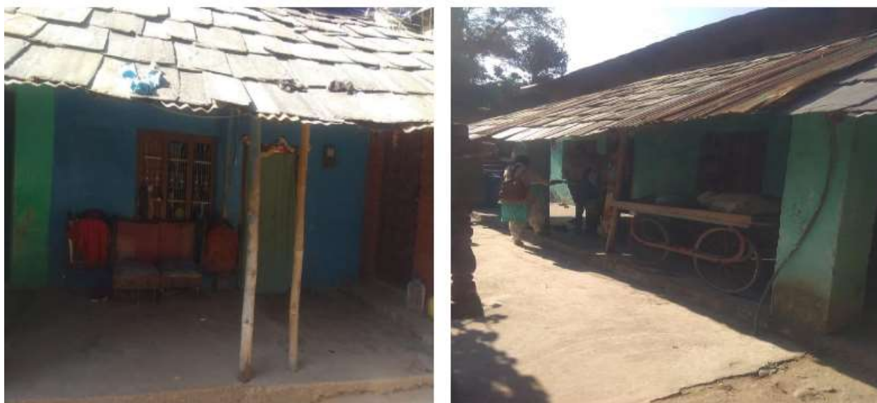
Plate: 2 Kuccha House